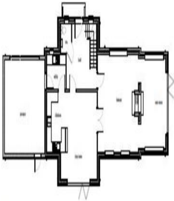
Plot 4 - Ground Floor Plan Household Number: 01207 246321