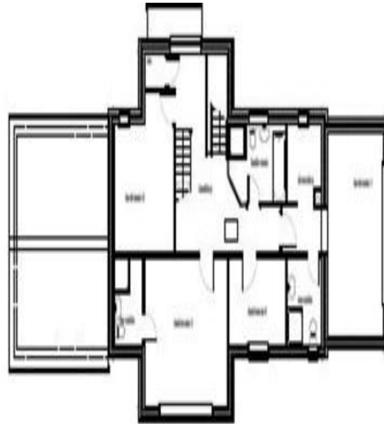
Plot 4 - First Floor Plan